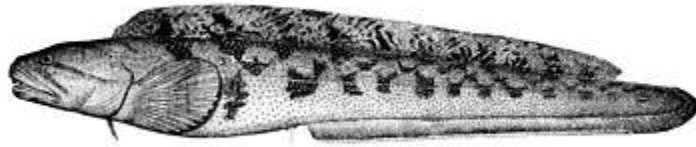
Figure 269 - Ocean Pout ( Macrozoarces americanus ), Eastport, Maine, specimen. From Goode. Drawing by H. L. Todd.

[ Jordan and Evermann , 1896-1900, p. 2457. Zoarces anguillaris (Peck) 1904.]